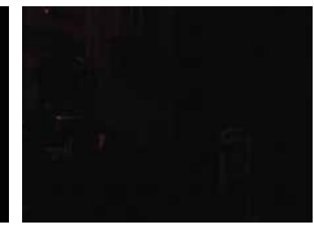
Standard M2 Flash Hider Visible Light