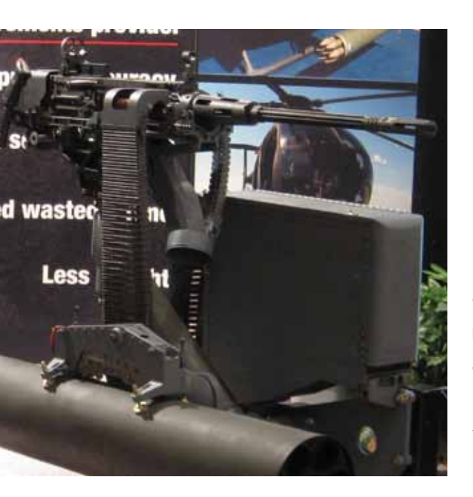
CFD-M3 .50 cal Machine Gun

A leader in the design and manufacture of armament mounting systems, CFD International applies decades of expertise in producing the highest quality products to introduce its new rapid-fire, 1,100 rounds per minute CFD M3 .50 cal Machine Gun . Based on the standard AN/M3 - but a marked improvement over competitors' currently manufactured models - the CFD-M3 is lighter in weight and provides a higher rate of fire while improving accuracy and reliability.