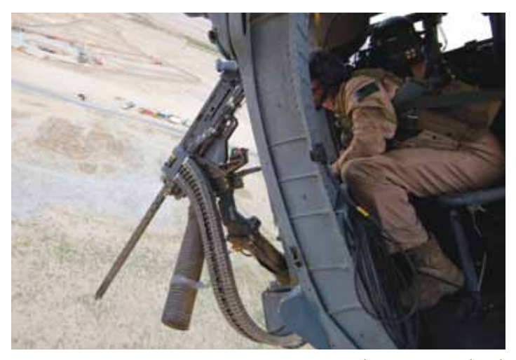
CFD-M3 .50 cal on H-60 Pavehawk

CFD International specializes in the design and manufacture of the finest weapons, mounting solutions, ammunition handling and fire control systems available today. We provide a turn-key, integrated solution customized to your specific needs and requirements. With over 26 years of experience, and holding more than 37 patents, we are the world leader in high quality, precision engineered weapons mounting solutions.