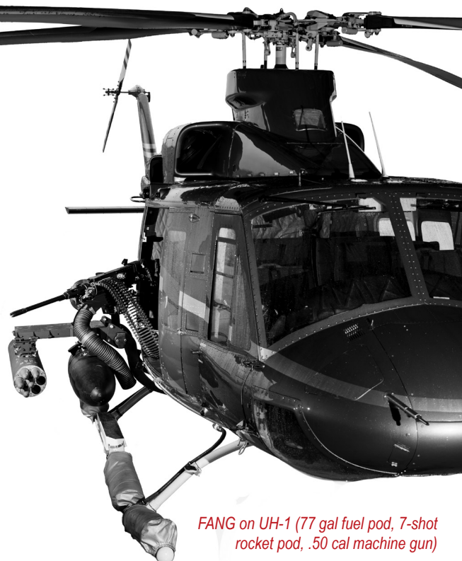
FANG on UH-1 (77 gal fuel pod, 7-shot rocket pod, .50 cal machine gun)