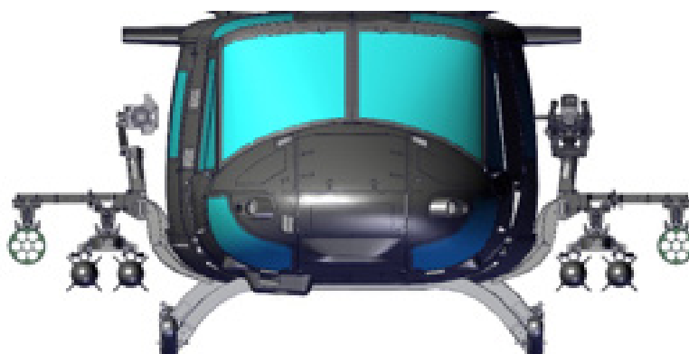
Six Store Stations (front view)

The outboard store station is attached to the inboard station via precision-machined lugs and our quick-release expansion pins. These pins ensure a zero-clearance fit between the components, thus guaranteeing boresight retention and pinpoint accuracy of the attached weapon. CFD's modular approach allows for maximum firepower when it is needed , and instant weight savings when it is not .