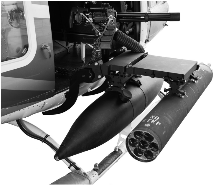
FANG on UH-1 (fuel pod, rocket pod, 7.62 mm Gatling gun)